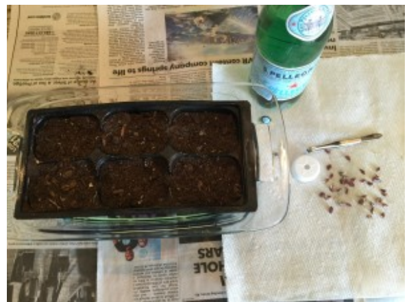
Bulbils (Bulblets) planted and ready to water

We like to use a pair of tweezers for planting seeds and now bulbils in the potting soil. Basically we use the pointed end to make a small depression in which to place the bulbil a little less than a half inch deep. This depth would vary by garlic variety as bulbil size varies by variety.