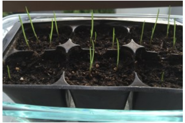
Germinating garlic bulbils