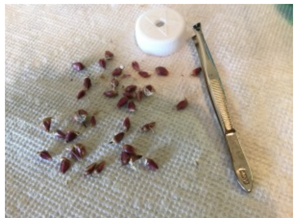
Garlic Bulbils (or bulblets)

A neighbor gardener gave me a dried mature scape (the remnants of the garlic flower). The mature scape on this variety is like a little cluster of about 75, one quarter inch long miniature garlic cloves. Scape normally only develop on hardneck varieties of garlic, however occasionally an individual softneck plant will grow one. These can be planted to be increased into a future garlic crop. It just takes a year or three longer. From what we could research these little garlics are called either Bulbils or Bulblets. We are going to refer to them as bulbils. We are going to plant about a third of these bulbils in a potting soil six pack, 4 to a cell, for future transplanting. We will also plant the other 2/3 directly into garden soil.