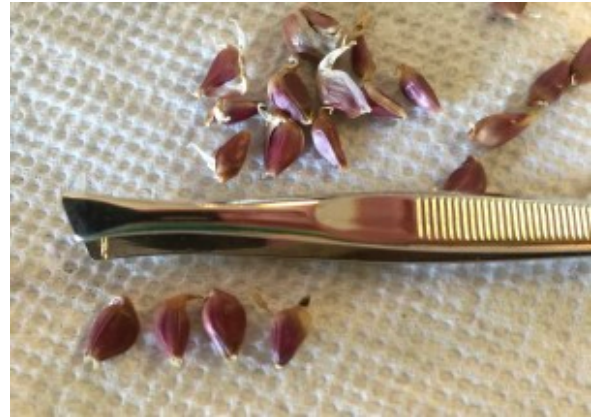
Bulbils (Bulblets) oriented like a large garlic bulb

shoot end up and root end down. Why not save the plant a little energy and point it in the right direction. Who wants to do summersaults buried in the dark ground.