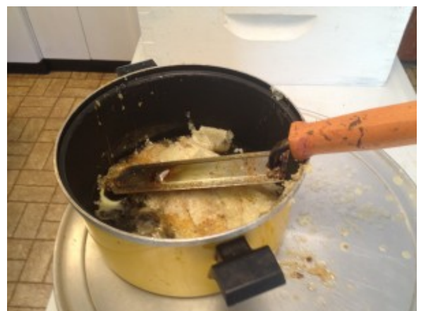
The wax caps are removed with a hot knife

The honey bees seal the wax honey cells with a cap once they are filled and the honey is ready to be sealed. The honeybees use their wings to create ventilation in the hive to remove excess water from the flower nectar, from which the honey is made. Once the sugar content of the honey is the proper concentration, the cells are sealed. Prior to extraction, the caps need to be removed. To do this we use an electric hot knife which cuts and melts the caps at the same time. The removed wax caps are saved to use later to make candles.