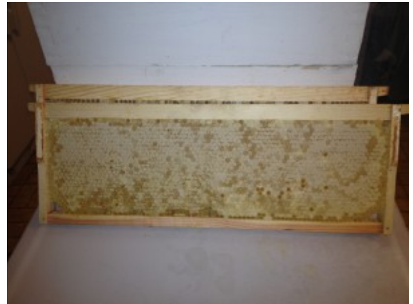
Frames of honey ready to be extracted

At the current time we only have a few honey bee hives and we do not have enough volume to use our large honey extractor. When we extract the honey from only a few shallow supers, we use the old antique honey extractor that we bought second hand over 30 years ago. This extractor is easy to operate and easy to clean. We are fortunate to have some beautiful fresh honeycomb to extract.