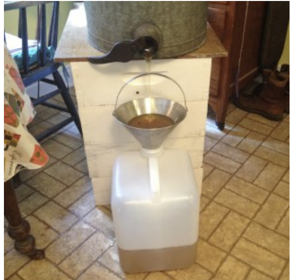
Emptying the extractor