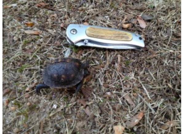
Baby map turtle next to a 3 1/2 inch pocket knife

it. It sat still for so long I became tired of watching it and I became distracted by something else in the yard. When I returned a few minutes later, it was no where to be seen. Certainly it had scurried under the nearby dead leaves in the woods just a few feet away.