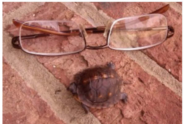
Hatchling box turtle first found in mid October in GA

In our case we found this hatchling within a few weeks of hatching. Since harsh winter weather is sometimes fatal to hatchlings, we decided to keep the turtle over the winter for spring release.