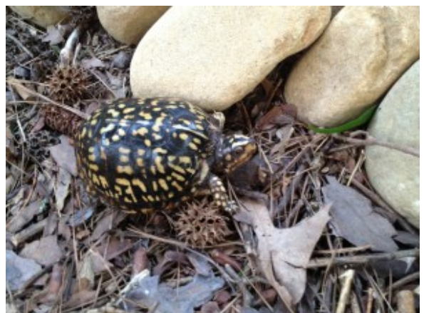
Mature Common Box Turtle (Terrapene Carolina, Linnaeus) (dark phase)

The Eastern Box Turtle has several color and shape phases. We observed both the box turtles pictured within our neighborhood. We often see evidence of their visits to our vegetable garden where they feed on low hanging tomatoes. You can tell by the bite marks that it is not a squirrel or some other animal.