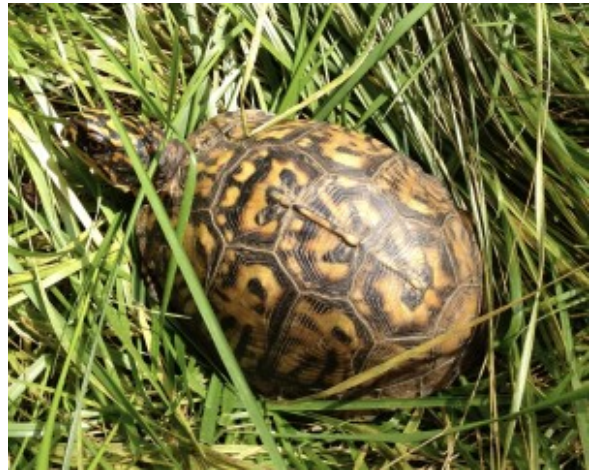
Mature Common Box Turtle ( Terrapene Carolina , Linnaeus) (yellow phase)

Although these box turtles look quite different in their appearance, this is quite normal for Eastern Box turtles. They are a welcome sight in our yard. We mainly see them in the spring or early summer before the hot months of July and August, and then again in early autumn as the temperatures cool down.