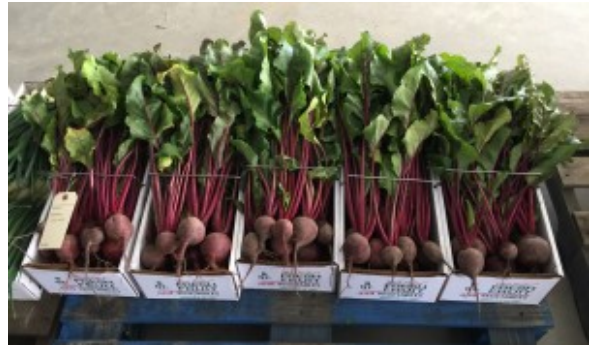
Beets for Sale!

For sellers, we took a photo of the “Selling Rules”. Not being a seller, we aren’t certain of the meaning of all the selling rules, but we are certain you can ask questions at the auction for clarity.