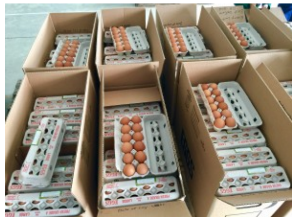
Eggs for Sale!

Some of the items for sale this past week included, eggs, beets, flowers, local strawberries, black raspberries, cucumbers, peppers, rhubarb, kale, cauliflower, carrots and onions.