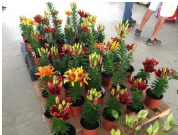
Flowers for sale!

One of our favorite things to do is to visit the Genesee Valley Produce Auction. We visited the auction for the second time in 2017, just before the Fourth of July weekend. The auction is getting into full swing for the summer with a full parking lot of buyers and a variety of produce items for sale. Be sure to take note of the changes of auction days and hours described below, for Summer 2017.